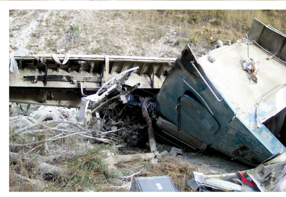
Bypassed CatchNET April 4, 2011. Crashed at milepost 86. Major injuries. Hauling bags of bentonite powder.