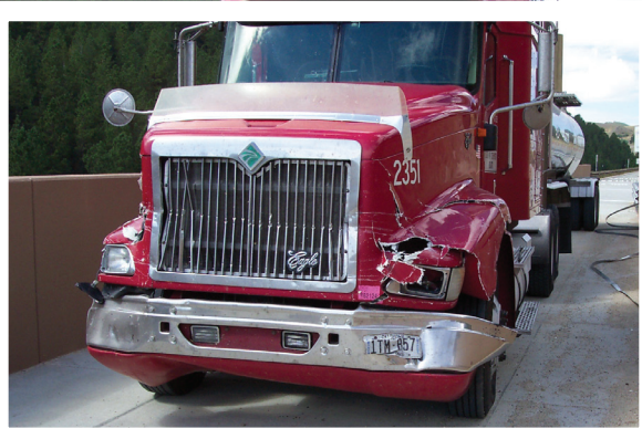
Used CatchNET August 31, 2007. No injuries, minimal damage. 80,000 lbs, 40 mph, used 5 nets.