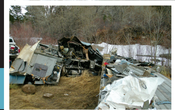
Bypassed CatchNET April 1, 2012. Crashed at milepost 86. Fatal injuries. Hauling bags of powdered sugar.