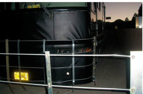
Used CatchNET August 26, 2010. No injuries, minimal damage. 15,000 lbs, 60 mph, used 1 net.